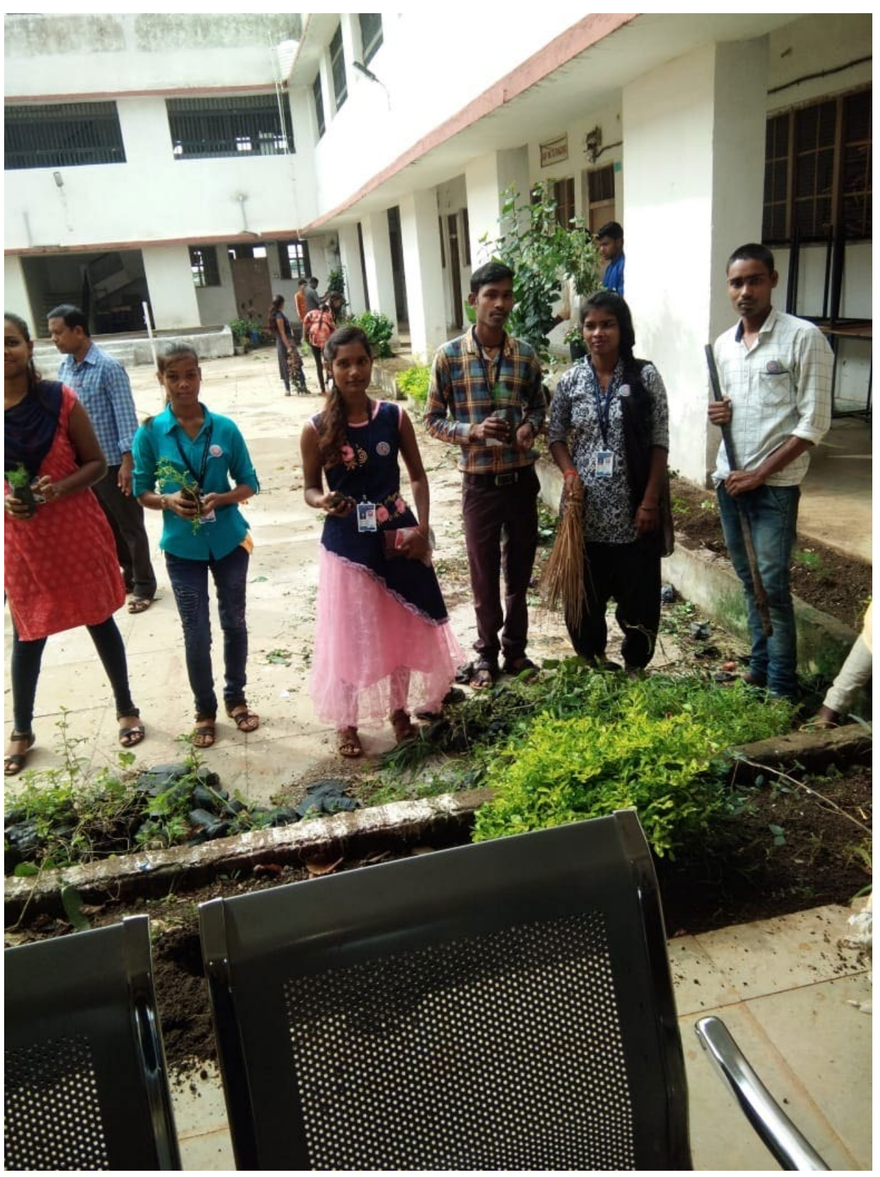
Cleanliness Drive in Govt. College Pamgarh