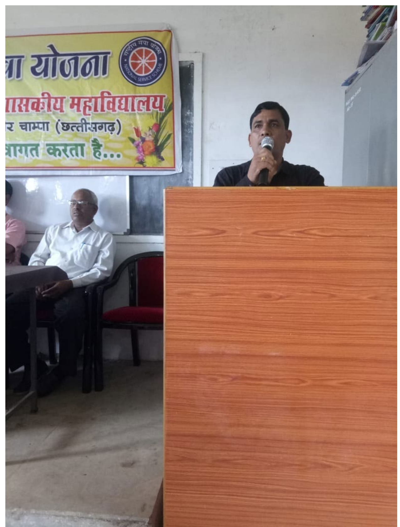
Awareness program of Legal Services in Govt. College Pamgarh